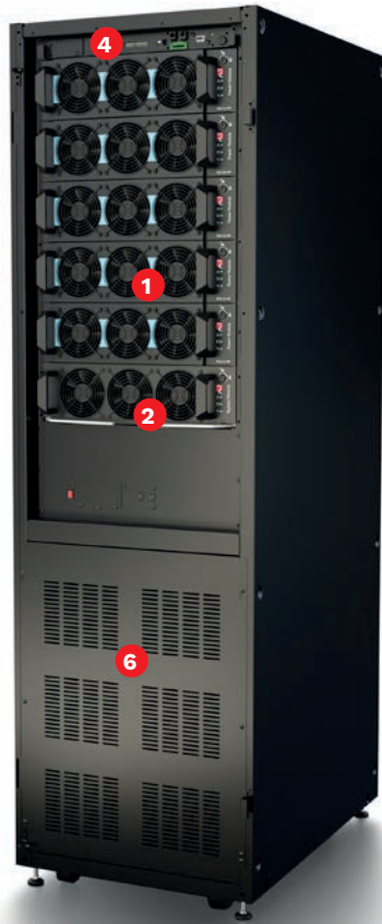
M2U 140 Power Cabinet