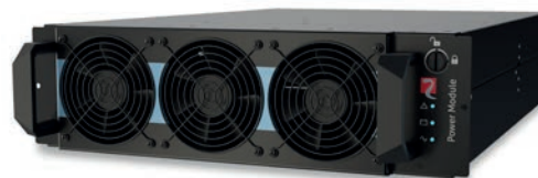
Power Module BLUE M2U 34 PM BLUE or M2U 20 PM BLUE