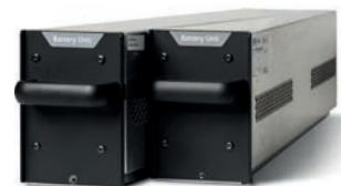
Battery Units - 2xBU